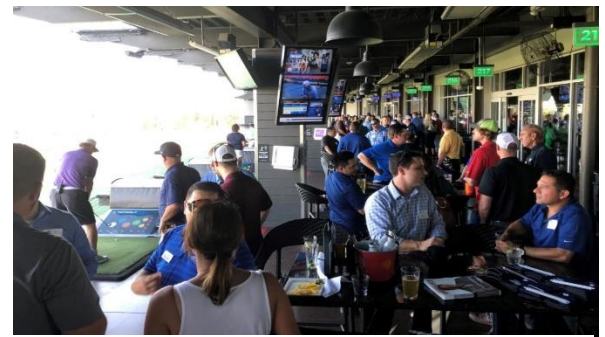
Folks enjoying a networking event at Top Golf

In the Fall, we’ve historically held a very successful Fish Fry and live auction. However, in 2021 we intend to try something new – a BBQ cookoff on a Friday night followed by a contractor rodeo Saturday morning. Member firms will enter one of their employees in a bull riding event, while everyone will enjoy tasty food thanks to the BBQ teams. There will activities for kids, too, at this family-friendly event. Should be fun, and fingers are crossed for a great first event!