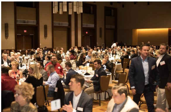
Guests at the AGC Outstanding Construction Awards Dinner

Starting in February, we host the annual Outstanding Construction Awards where general contractors and their building partners celebrate the best projects completed in the previous year, as decided by a panel of industry judges. This reception and dinner event is held on the University of Texas campus, typically attracts over 300 people, and always brings big smiles to the faces of the award-winning teams.