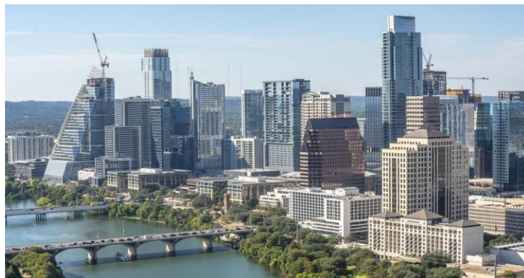
Austin Skyline 2021

What will the next 75 years bring to Austin and our skyline? We can't be certain exactly what this town will look like in the year 2096, but it's reasonable to expect that it will look quite a bit different from today while still retaining many older