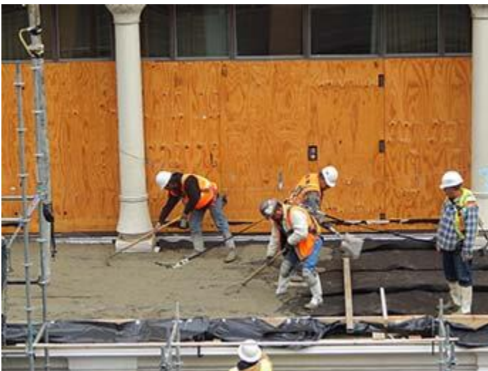
Workers with Chamberlin finish concrete on a Driskill balcony

Standing in the hallway of the hotel's 2 nd floor while waiting for guests to arrive to the party on the evening of December 7 th , AGC staff and volunteer leaders had the opportunity to reflect on how the construction accomplishments of the industry's past continue to influence and benefit our community of today. Current Chairman of the Austin AGC