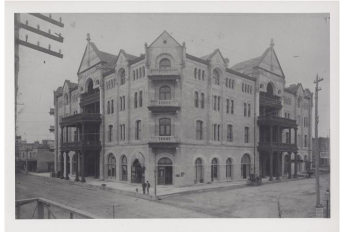
The Driskill in 1888