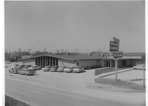
Villa Capri Restaurant in Central Austin Where the AGC Hosted 1971 Meeting About the New OSHA Workplace Safety Law