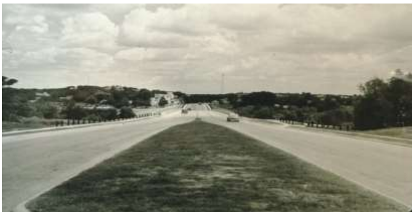
Looking south in the 1940s across Lamar Bridge. The original Austin AGC office would soon be built just beyond the white building on the left.