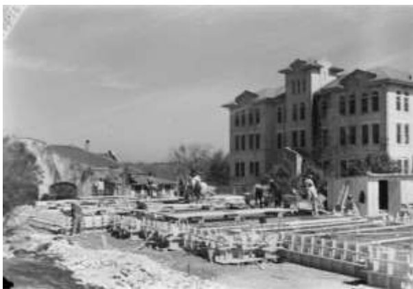
Shelton Chapel Under Construction in 1942