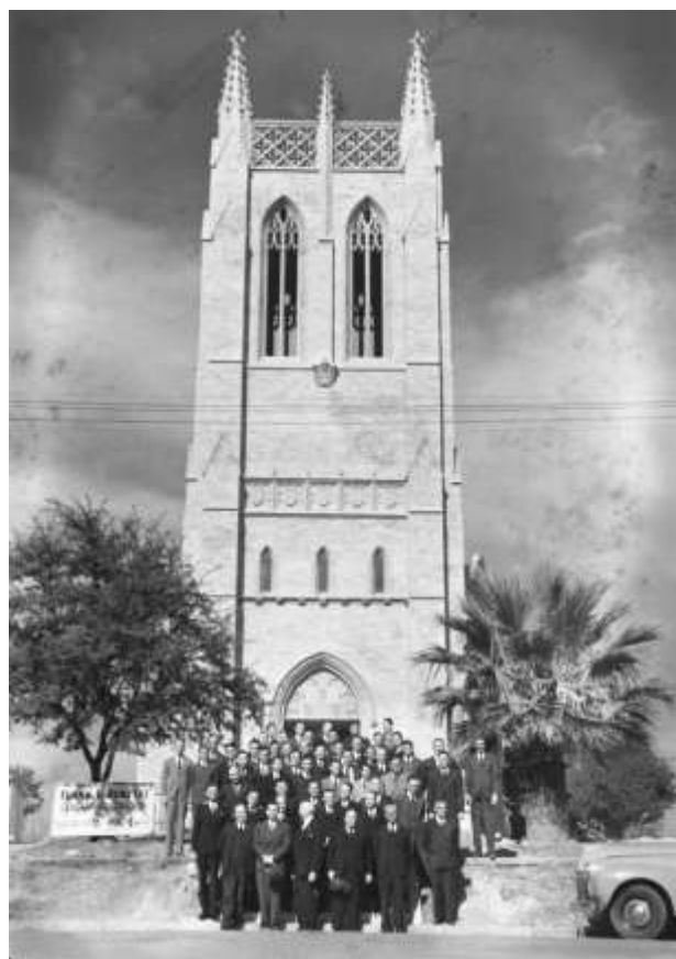
Seminary Students in Front on Newly Built Shelton Chapel (Rundel Construction sign visible to left)

A second option for the new Austin AGC office centered on leasing land from the Southern Pacific Railroad off Red River between East 3 rd and 4 th Streets, the same block where the Moontower Café is located today across from Convention Center. As a last resort if no other viable options emerged, AGC leaders considered renting room in the Alamo Hotel that was located at the northwest corner of 6 th and Guadalupe. It had quite the interesting history as detailed recently here .