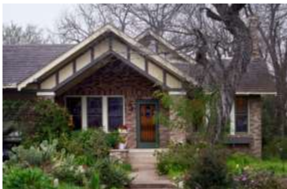
3801 Duval built by Frank Rundell in 1929