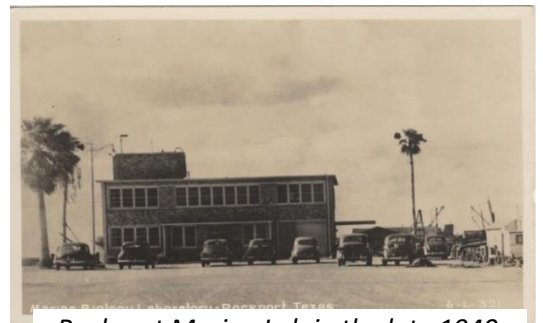
Rockport Marine Lab in the late 1940s